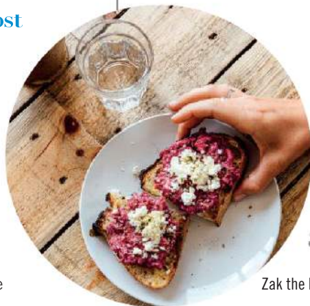
Zak the Baker.

Breakfast or lunch at Zak the Baker . I met him at the space where he used to bake in Hialeah, blasting this incredible kibbutz music, with all these